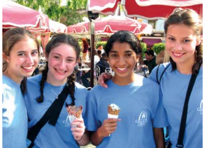
Time for relaxation on the Los Angeles tour.